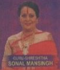
INDIAN TEAM LEADER SONAL MANSINGH

MONDAY & TUESDAY 10.00-11.00 PM ONLY ON REPEAT TELECAST: WED - THUR 10.00-11.00 AM DD NATIONAL